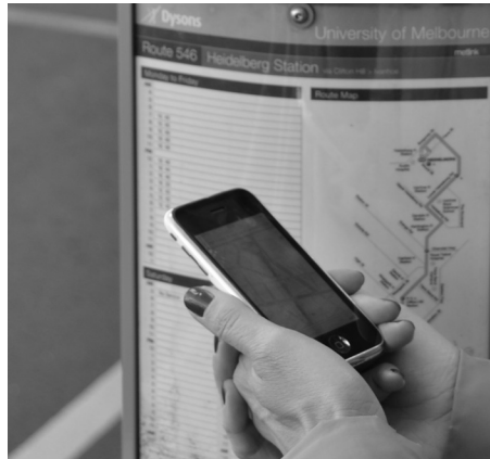
Figure 1: Sample EPS figure.

Figure 1 shows how to include a figure as encapsulated postscript. The source of the figure is in file fig1.eps .